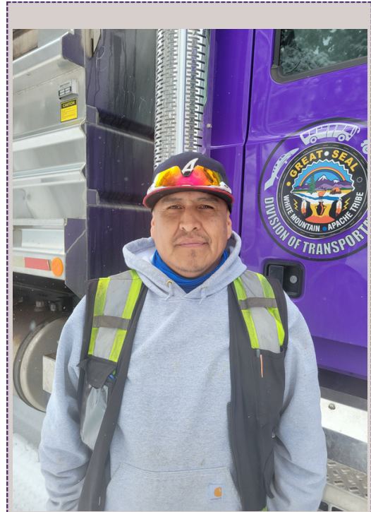
Harold Palmer Road Maintenance