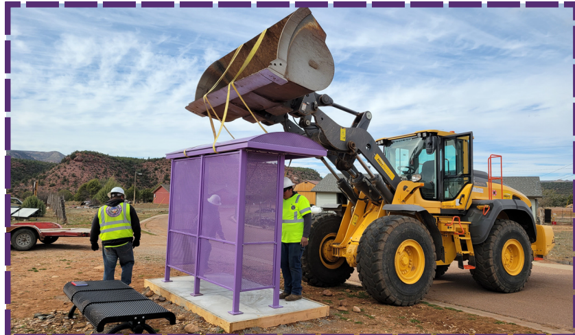
Carrizo Bus Stop Shelter - Complete